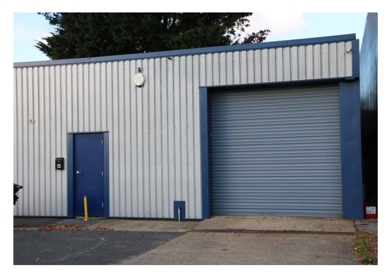
Gross Internal Area approx. 78.50m<sup>2</sup> (845 ft<sup>2</sup>)

3 phase electricity. Toilet. Kitchenette. Personal door.